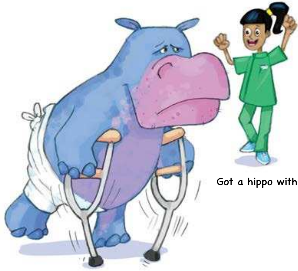
Got a hippo with a hip replacement...

Hippos are only found in Africa. They eat grass and other plant food.