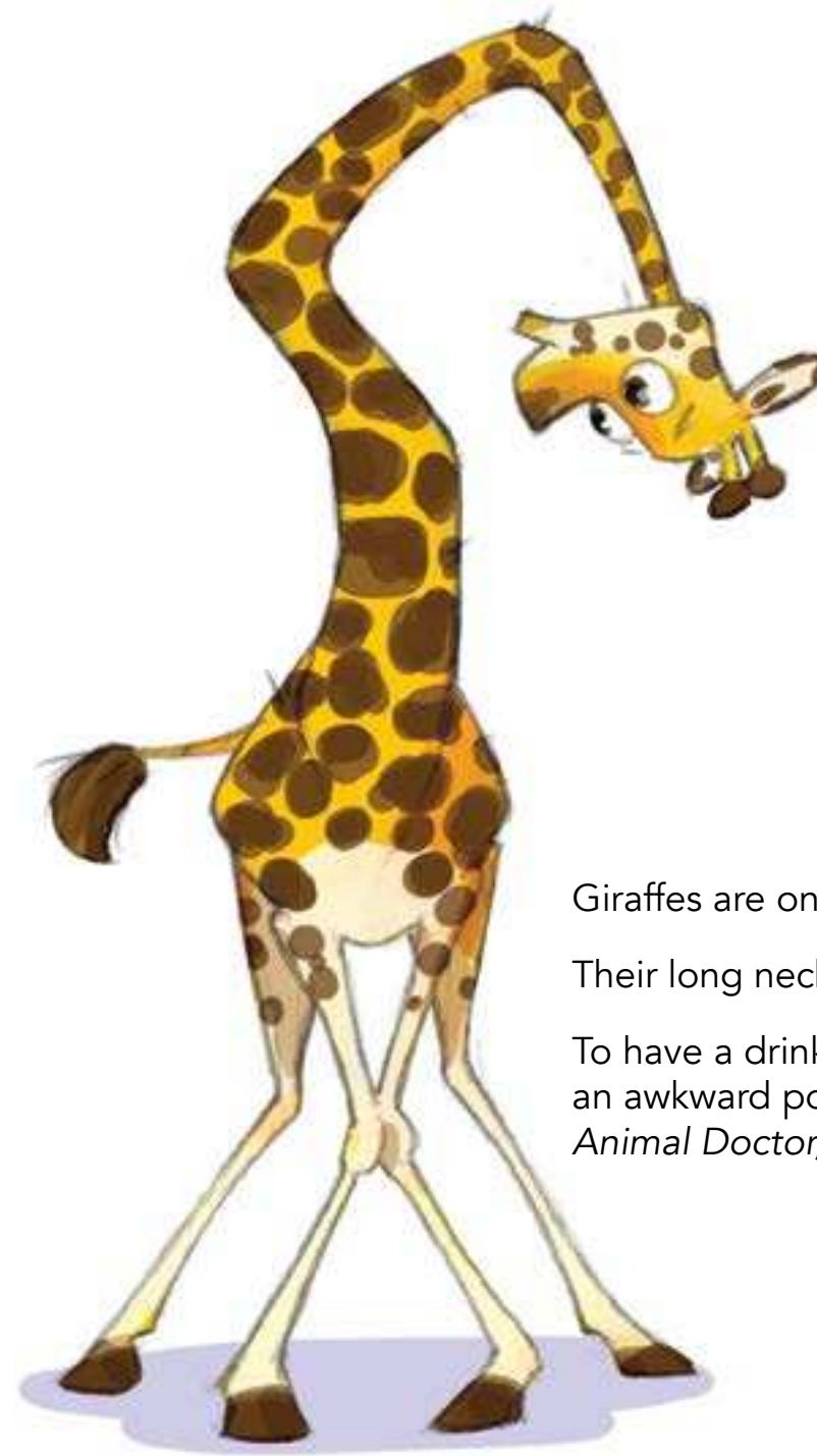
A giraffe with a pain in the neck.